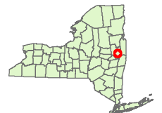
FIGURE: SURVEY DATE: MAP DATE: 2010_1 5/28/10 6/1/10

11 JOHN ROAD SUTTON, MASSACHUSETTS 01590 PHONE: (508) 865-1000 FAX: (508) 865-1220 WEB: WWW.AQUATICCONTROLTECH.COM